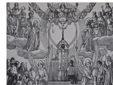
An Explanation of the Mass August 20, 2015

Adults who wish to be Confirmed should speak to one of the priests or leave their contact information in the office or bookstore and one of the priests will contact them.