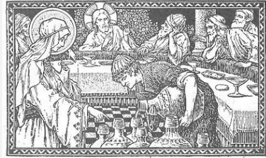
Jesus changes the water into wine at the marriage feast of Cana