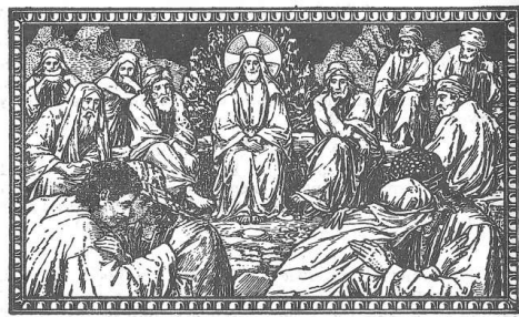
Be reconciled to thy brother