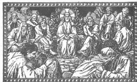
Be reconciled to thy brother

Sunday, May 21, 2017 5th Sunday after Easter