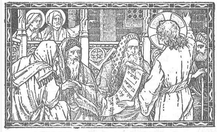
Jesus among the doctors in the Temple