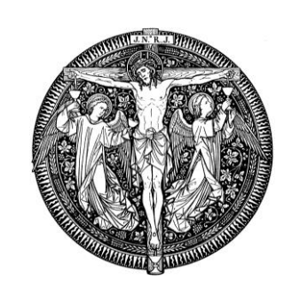
26 August 2018 Fourteenth Sunday after Pentecost