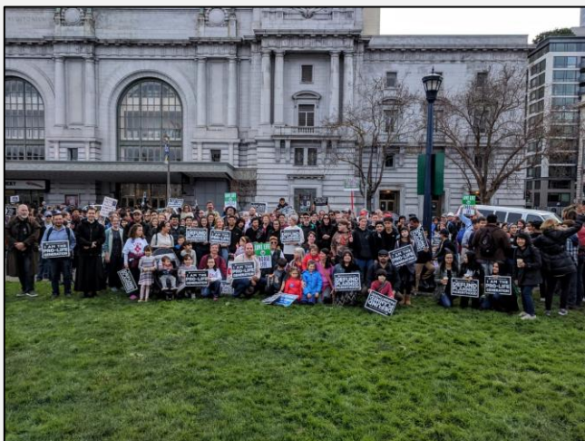
Some of our parishioners at the Walk for Life!

"But when the Paraclete cometh, whom I will send you from the Father, the Spirit of truth, who proceedeth from the Father, he shall give testimony of me. And you shall give testimony, because you are with me from the beginning." – John 15:19-27