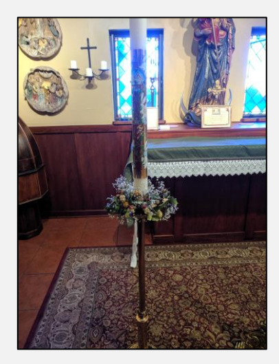
The old paschal candlestick.

Recently, we were able to acquire a new paschal candlestick from a company in New York. The new candlestick is slightly taller than the old one, and matches the Baroque style of our altar candlesticks, although it is more ornate. It came with a 2.5" socket for the candle, which is the same as what we have currently, but we also acquired a 3" socket, so that we can use a slightly larger candle next year. I hope to have the candlestick available for viewing this Sunday, June 23. I do ask, however, that people refrain from touching it, to keep the brass from oxidizing and pitting. God bless!