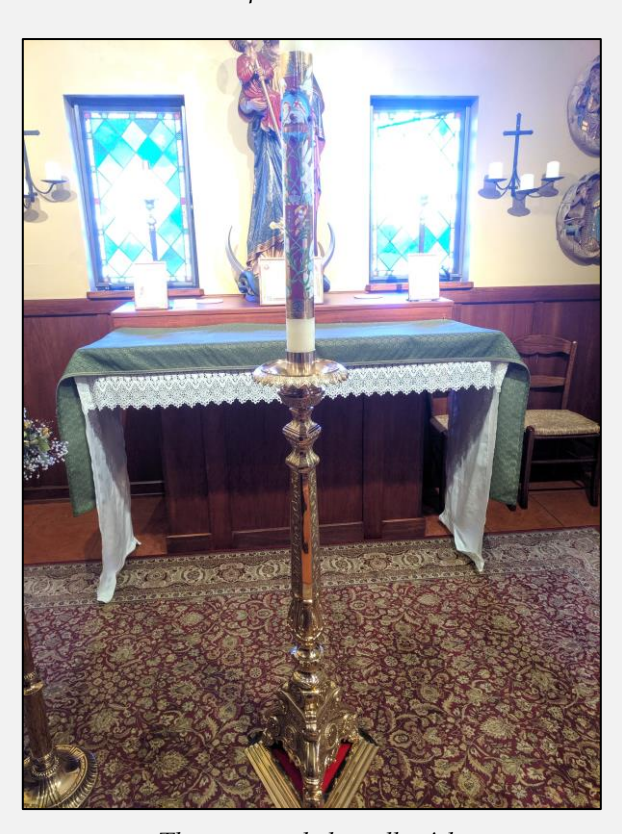
The new paschal candlestick.