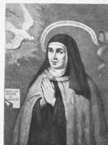
Our Lady of the Sign She is the patron of the Holy Rosary.