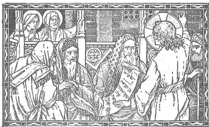
Jesus among the doctors in the Temple