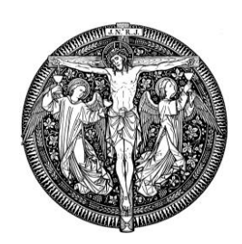
17 March 2019 2<sup>nd</sup> Sunday of Lent

8:00 am FSSP Priests 10:30 am Pro Populo