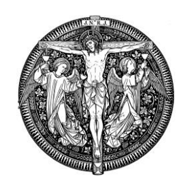
24 March 2019 3rd Sunday of Lent