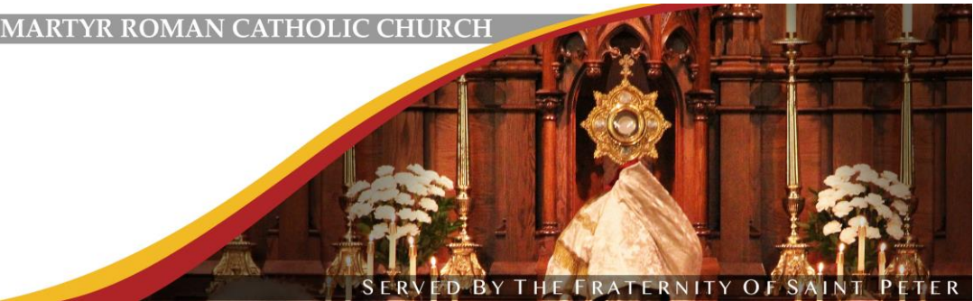
SERVED BY THE FRATERNITY OF SAINT PETER