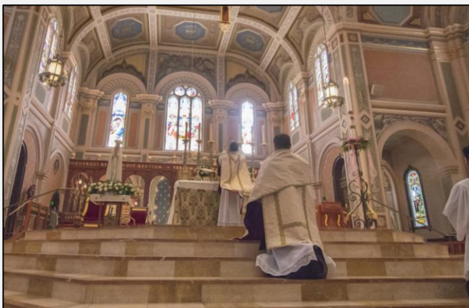
The Solemn High Mass offered in 2019 for the Procession.

Please consider attending the Marian Procession this year. This beautiful event concludes at the cathedral, at which the bishop has graciously give us leave to offer a Solemn High Mass. Details are available under the Announcements .