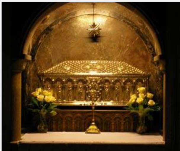
The remains of St. James the Greater have been sought by pilgrims for many centuries. They are kept in Compostela, in northwestern Spain.

One of my favorite musical works is a reconstruction of Vespers of Saint James, based on manuscripts discovered from about a thousand years ago. It provides one of the earliest examples of polyphony, and the entrance hymn (not properly part of Vespers itself) makes use of a Gothic phrase common to this day among pilgrims: Ultreia! And the response: Et susseia! This is a word of encouragement and edification: Go further! says one pilgrim; And go higher! returns the other. That is to say, keep persevering, keep marching forward, but do not forget also to keep your mind on Almighty God. If you are interested, you can listen to the tracks by searching for: Ensemble Organum - Ad Vesperas Sancti Iacobi.