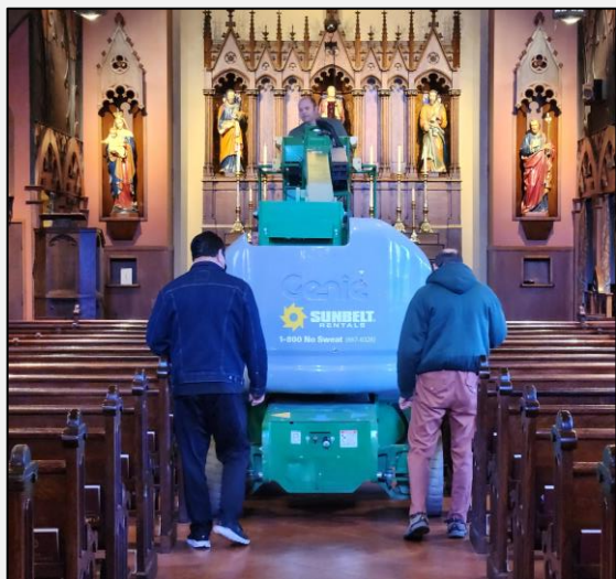
Above: Tom Scarry navigating the knuckle boom lift into position. Below: The new sideboard in the side chapel for storage of items immediately related to the sacred liturgy.

Recently we rented a knuckle boom lift to take care of some repairs in the sanctuary. We were able to repair the crenellations on the top of the reredos, as well as catalogue and repair the various spotlights and their fuses. Measurements of the statue alcoves and the large elevated cross were also taken in order to facilitate a long-term project of installing curtains that will be used to obscure the statuary during Passiontide.